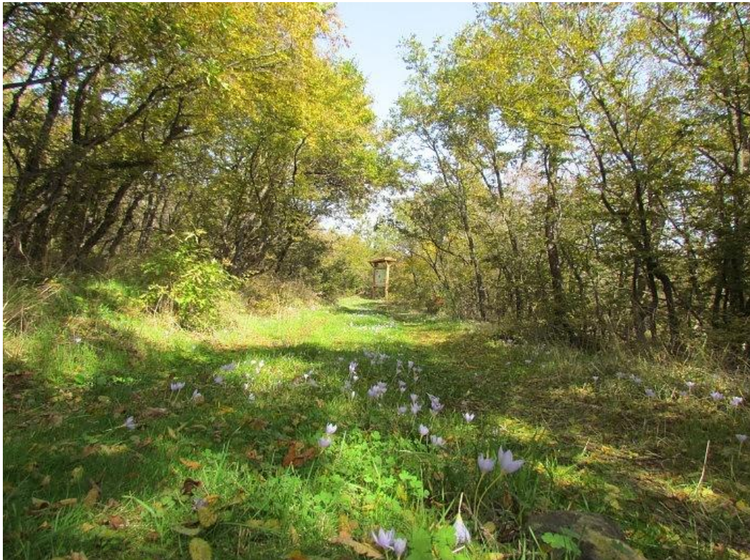
Tourist eco trail: „Sarnitsa village - Angel voyvoda“