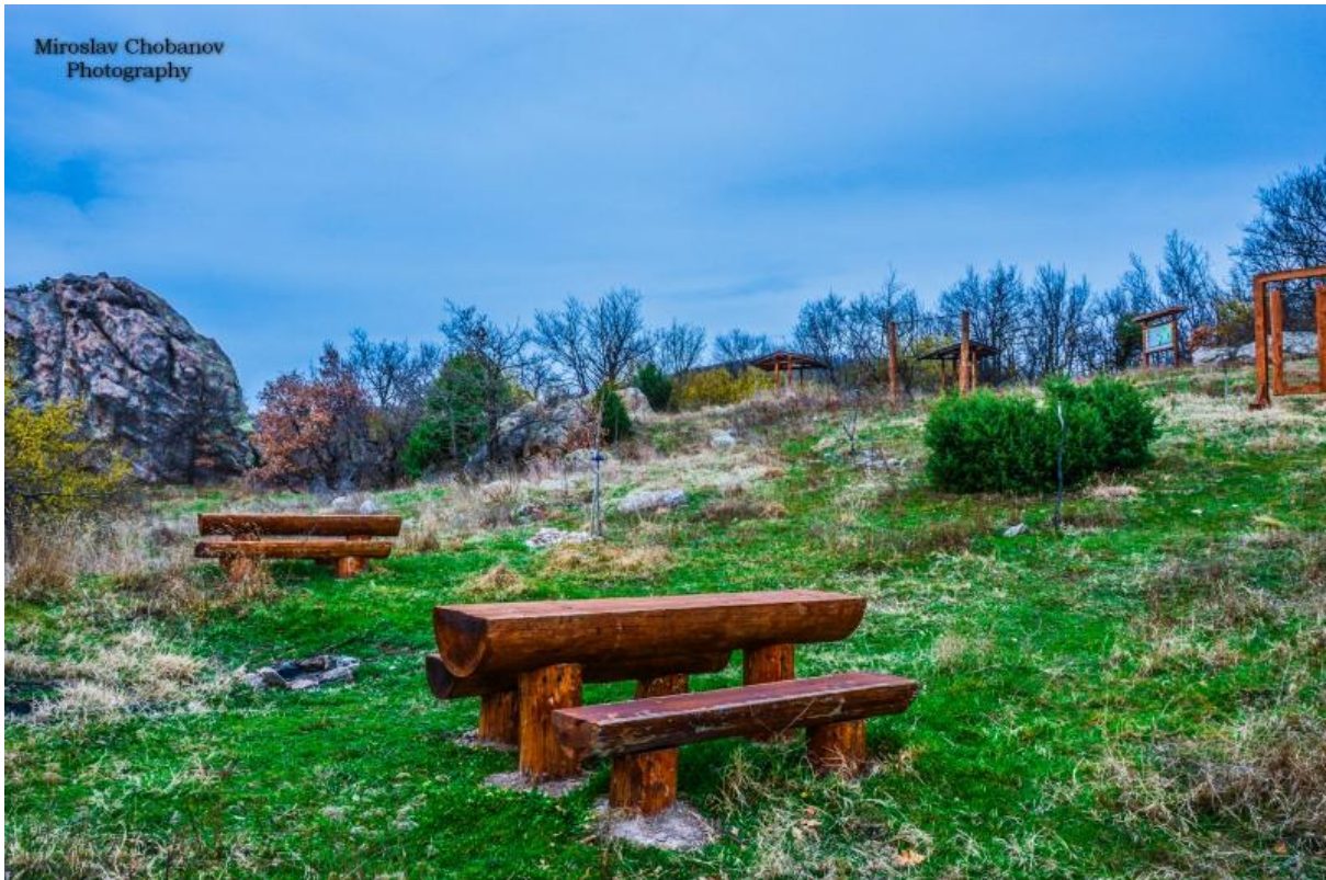
Tourist eco trail: „Sarnitsa-Kupena-Orlovi skali“